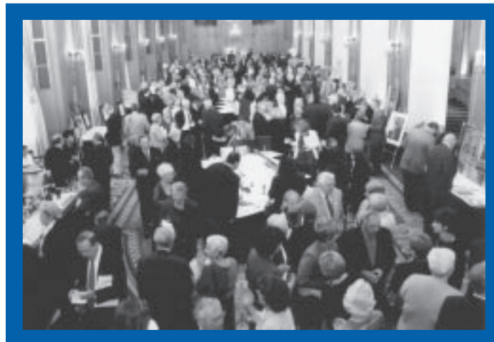
Guests enjoy silent auction bidding and the cocktail reception.