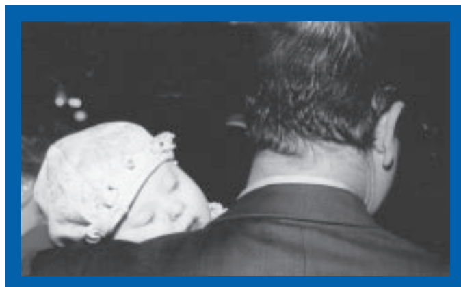
The Gala was full of excellent entertainment, remarks, silent auction items, conversations, reunions, food and celebration—all in the cause for life and the benefit of Aid for Women clients and their children.