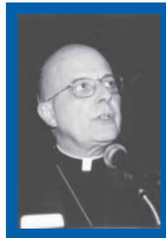
Francis Cardinal George, O.M.I., Archbishop of Chicago, offers inspiring remarks and an invocation.