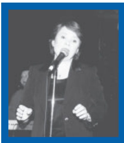
The Honorable Dana Rosemary Scallon, MEP, entertained guests with songs and stories.