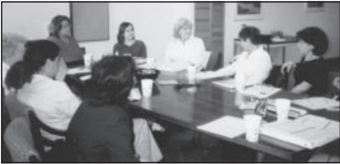
Volunteers discuss counseling techniques at a previous training session.

The dedication of each volunteer pregnancy counselor is impressive. Aid for Women is incredibly grateful, for without the commitment from our counselors, we could not rejoice in the many lives we touch. Our counselors take pride in their work and because of that, they are women of prestige and honor.