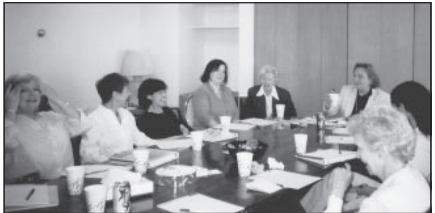
Volunteer pregnancy counselors, volunteer mentors and staff enjoy an afternoon of special training for the mentoring program earlier this year.

We updated our policy and procedure manual and reference manuals also in preparation for expanding our Hotline service. Now everything our counselors need to know is organized into one complete package.